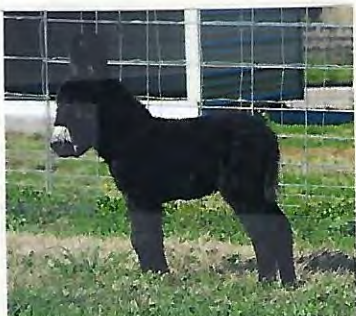
HHAA Promises Promises 2.jpg

The American Donkey and Mule Society P.O. Box 1210, Lewisville, TX 75067 (972) 219-0781 The American Donkey and Mule Society is not responsible for errors in information submitted to the registry.