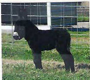
HHAA Promises Promises 2.jpg

The American Donkey and Mule Society P.O. Box 1210, Lewisville, TX 75067 (972) 219-0781 The American Donkey and Mule Society is not responsible for errors in information submitted to the registry.